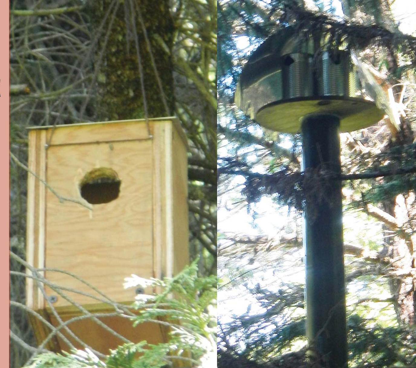
Left: Chickadee Cottage Right: Bird Bungalow

The Songbird Refuge consists of four unique bird shelters; The Don't Draw-Pot, The Bird Bungalow, The Wood Duck Inn, and The Chickadee Cottage. The Don't Draw-Pot is a tea pot re-purposed as a birdhouse, mounted in an upcycled desk drawer to provide additional shelter. The Wood Duck Inn and Chickadee Cottage are rectangular wooden boxes with upcycled sheet metal roofs. The Bird Bungalow houses 4 seperate nests in spacious ravioli cans, with additional protection provided by a rounded metal roof.