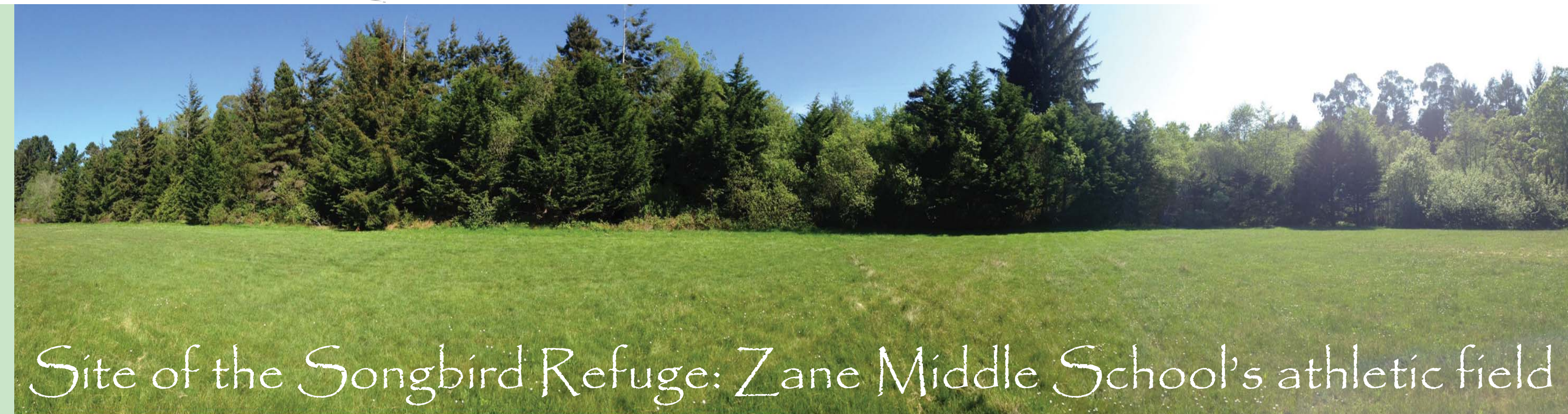
Site of the Songbird Refuge: Zane Middle School's athletic field

The Appicateers were comissioned by Zane Middle School to design and build birdhouses for migratory songbirds. The birdhouses are part of a community nature trail that is in the process of being built.