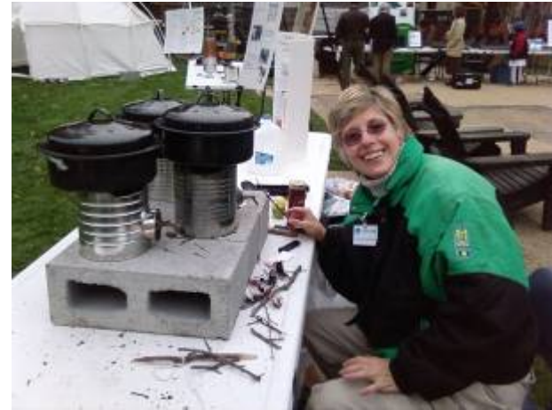
High Efficiency Thermal Stoves