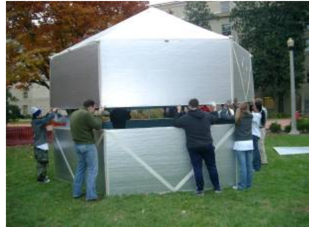
Assembling a 12' High Hexayurt