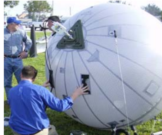
ShelterBox supports 10 people GATR Inflatable SATCOM Dish provides bandwidth