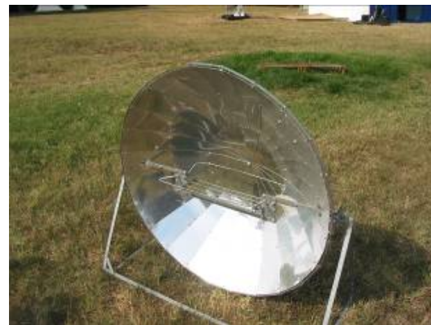
Parabolic Solar Cooker