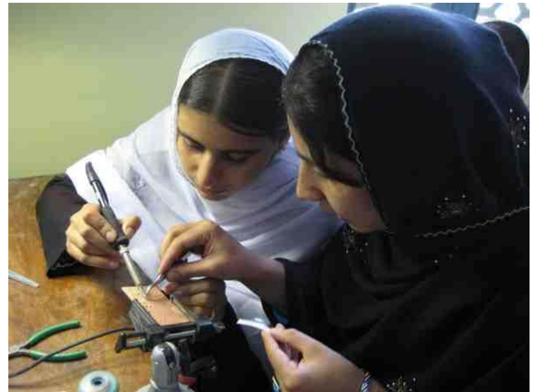
Afghan Women soldering at Fab Lab