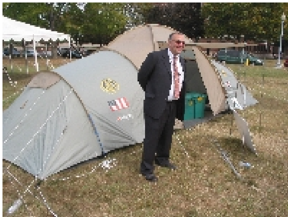
ShelterBox Distributed by Rotary Clubs