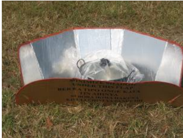
Simple Cardboard-Backed Solar Cooker