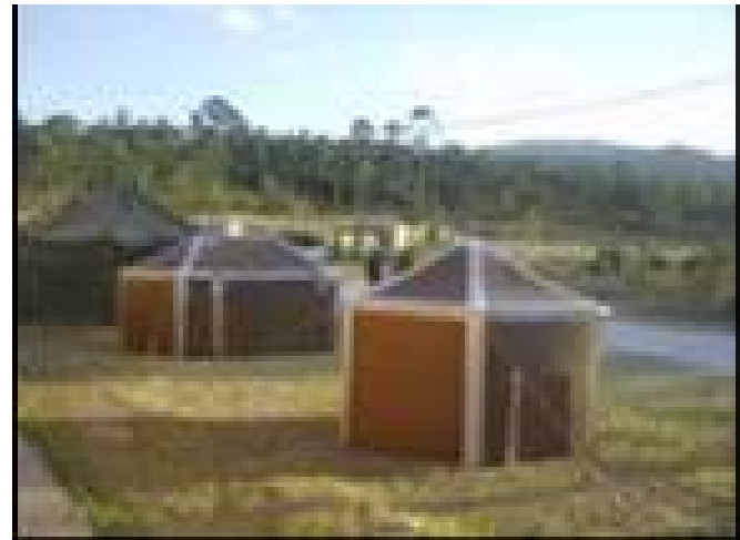
6' Hexayurt & Stretch in Honduras 9