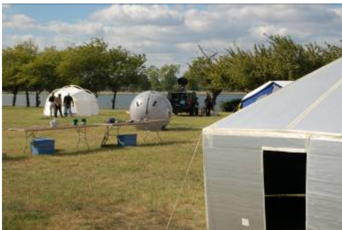
Inflatable SATCOM Dish & Comms Vehicle