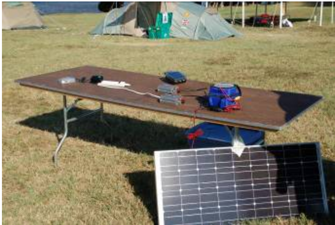
80 W Solar Panel Charging AA Batteries