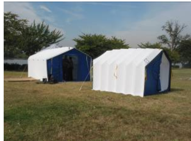
Two UniFold Accordion Shelters