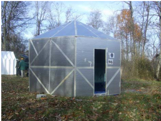
Completed 12' High Hexayurt