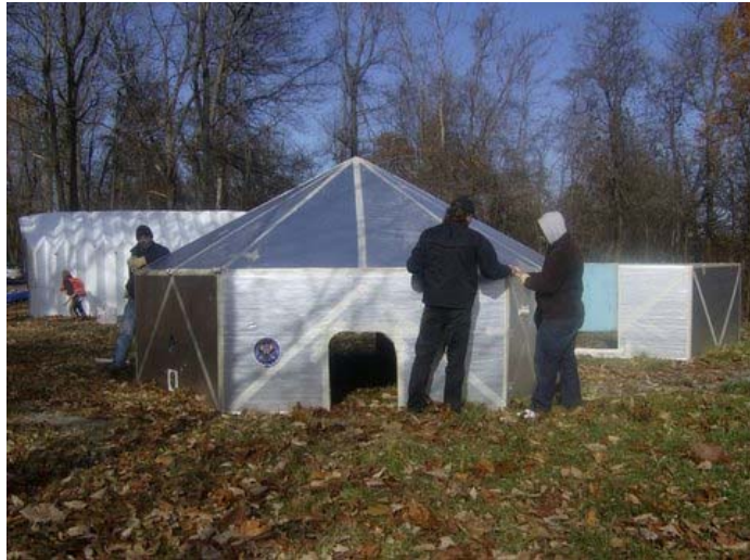
Taping roof section to walls for 12' hexayurt