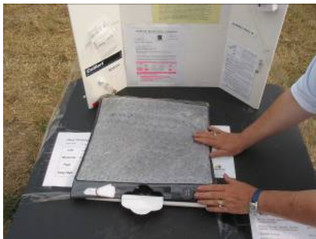
Solar Water Pasteurization