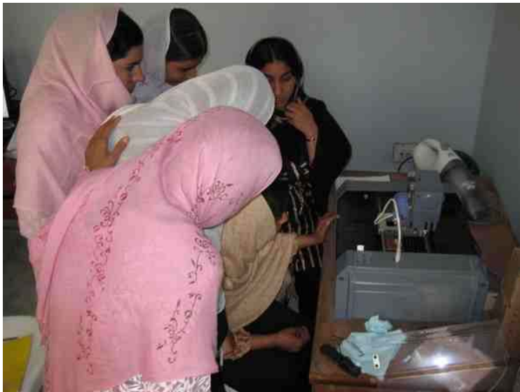
Afghan Women at Fab Lab