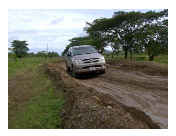
Figure 11. Four wheel drive vehicle on the main highway between San Carlos and the Capital, the main access route to Morrito.