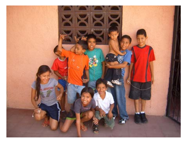
Figure 6. Typical Nicaraguan children full of hope and happiness.

The following financial donations are needed to implement the Education Assistance project: