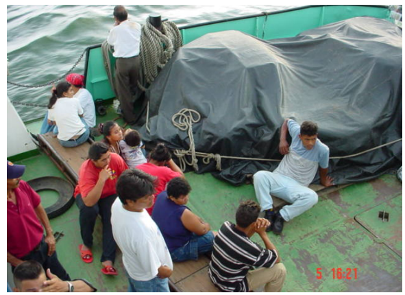
Figure 12. Passengers get some fresh air during the twice weekly 8 hour boat ride between Morrito and Granada or San Carlos.

The following financial donations are needed to implement the Community Boat Transportation project: