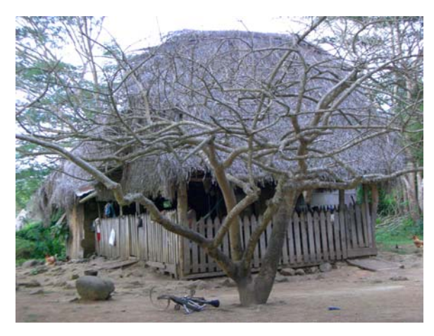
Figure 9. Example of the typical construction style for rural schools of Morrito.