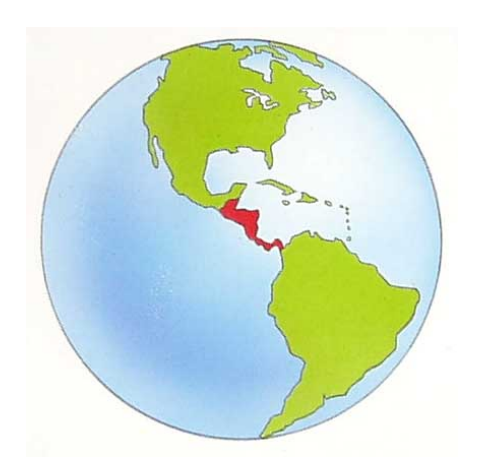
Figure 1. The Americas include the North, Central, and South American continents.

Nicaragua is considered to be the second poorest country in all of the Americas. Morrito is a municipio (similar to a county in the US) in the departamento (similar to a State) of Rio San Juan. The Municipio covers 677 Km<sup>2</sup> of semi-humid tropical savanna used primarily for raising cattle and cultivation of rice, beans, and corn. The total population is approximately 1,000 "town" residents and 5,000 rural habitants, with includes a total of about 3,000 people under the age of 16-years-old (Morrito, 2002).