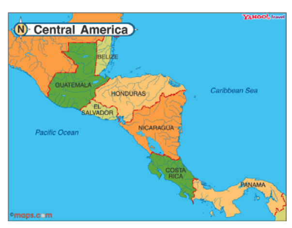
Figure 2. Map of Central America showing Nicaragua bordered by Honduras, the Caribbean Sea, Costa Rica, and the Pacific Ocean.

According to the World Bank, more than 25% of rural Nicaraguans live in extreme poverty, living on less than 1 dollar a day. One in five children is chronically malnourished. In 1999, of eligible primary students, 75 percent were enrolled, with 32.6 percent of eligible secondary students in school, and literacy was 65.7 percent for all citizens over the age of 15 (Education, 1999).