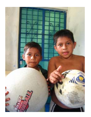
Photo 8. Kids showing off their prized soccer balls.

The following financial donations are needed to implement the Sports and Well-Being project: