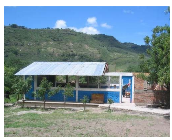
Figure 10. A school building under construction in a rural Nicaraguan community.

The following financial donations are needed to implement the School Building Improvement project: