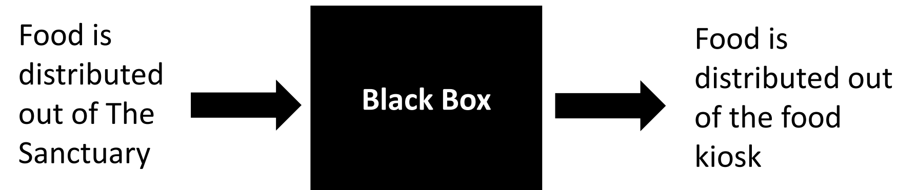
Figure 1-2 The Black Box Model of the Abundant Free Food Kiosk

The A Team has built the Abundant Free Food Kiosk to solve this problem by providing a new way of giving out the food donations. The Abundant Free Food Kiosk is an outdoor, water proof cabinet that food can be stored in with doors on the front and back. The front doors are used by the public to access the free food inside the kiosk at street level, and the back doors are used by The Sanctuary to place the food donations inside. As members of the community walk by on the street, they are able to look at the chalkboard doors to see what is available inside.