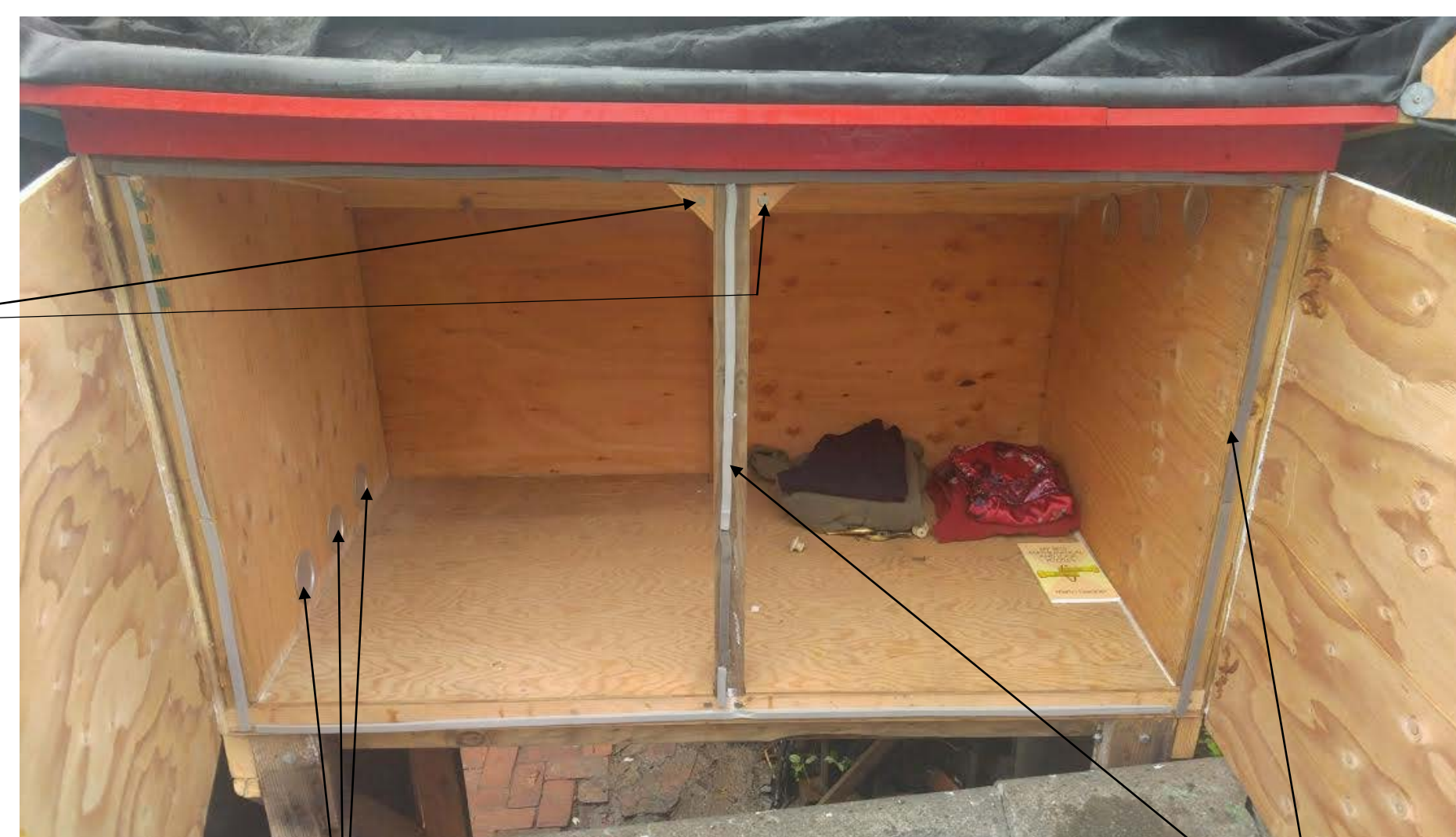
Figure 1-4 An inside view of the kiosk

Magnets help keep the doors shut tightly