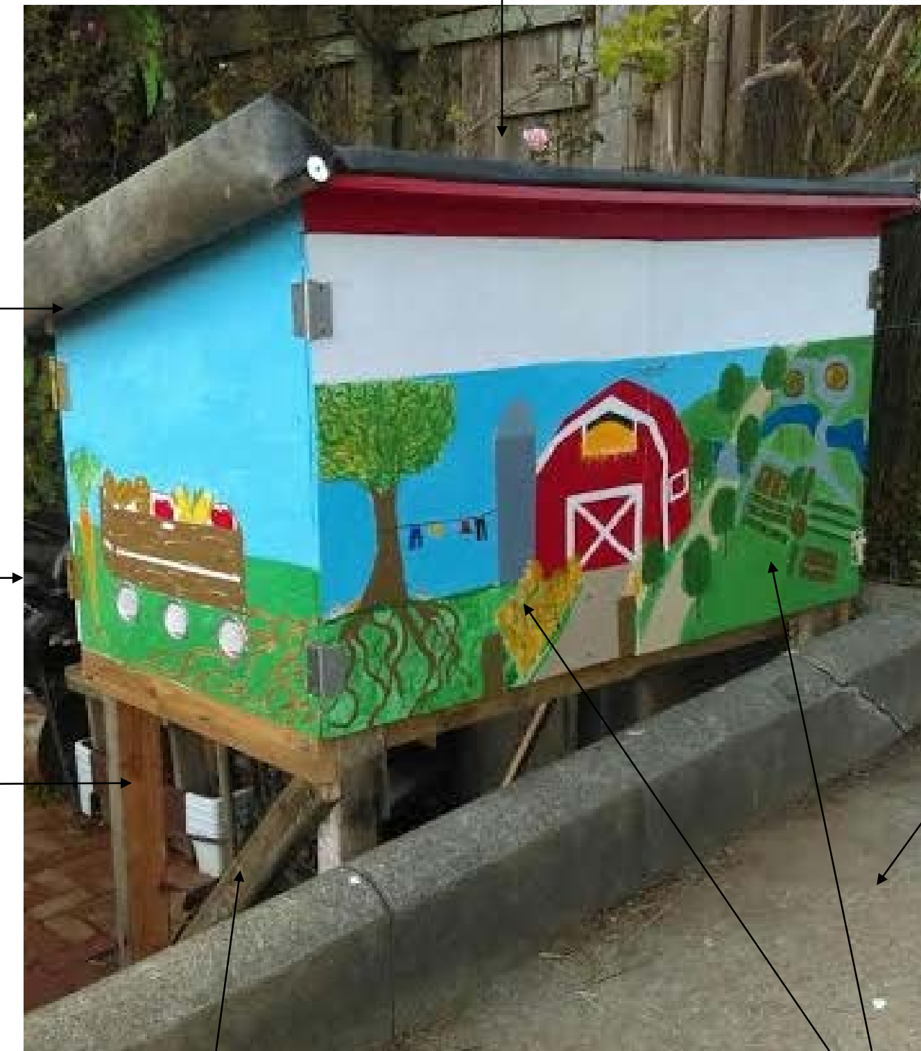
Figure 1-3 The final project

Pond liner on the roof makes it waterproof and houses a live roof of plants